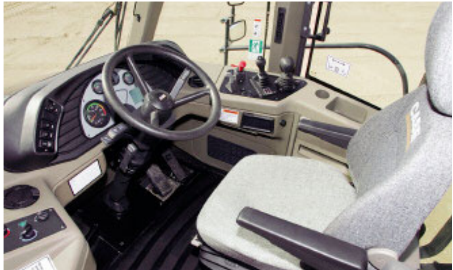
The right-hand console is designed to provide better operator control. Among its operator-friendly features are: push-button change from manual to automatic shift and bump shifting.

operation and productivity in mind. The low-effort control level commands the transmission, dump body and braking systems.