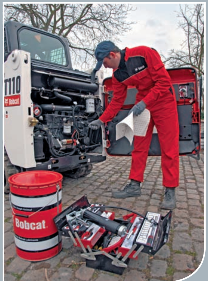
Transverse-mounted engine and swing open tailgate offer increased ease of maintenance.