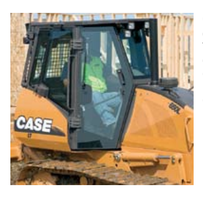
Quieter, more comfortable cab

The optional isolation-mounted cab makes the 650L one of the quietest working spaces in the industry. A fully adjustable cab environment enables you to match any operator preference.