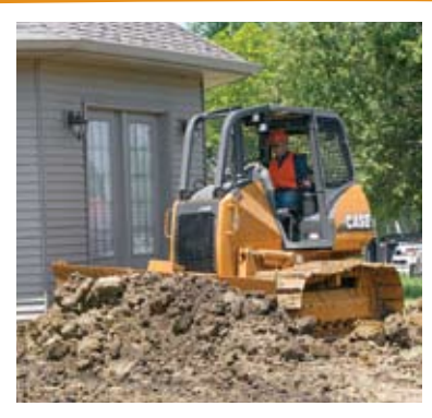
Low operating height

The optional isolation-mounted cab makes the 650L one of the quietest working spaces in the industry. A fully adjustable cab environment enables you to match any operator preference.