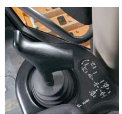
Single-lever blade control

The narrow Advanced Instrumentation Cluster and tapered hood provide wide open visibility to the blade to gauge material flow.