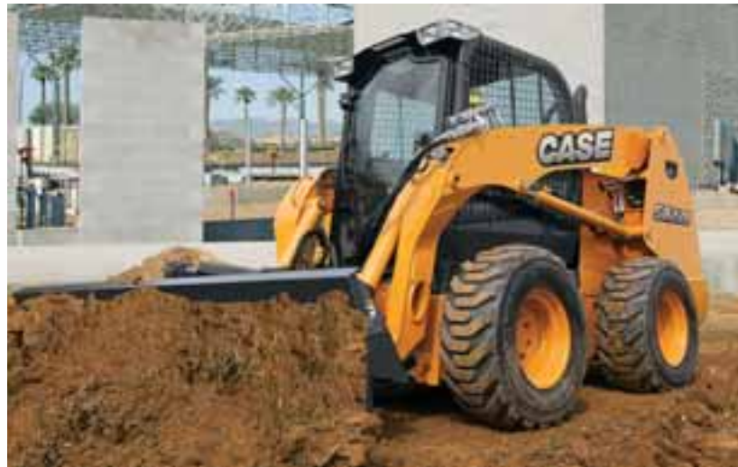
With a quick-coupler, you can switch attachments without leaving the cab.

Want more info? Visit www.Casece.com or www.CompareCase.com . Then, see your Case dealer for a demonstration, and put a new Case skid steer to work.