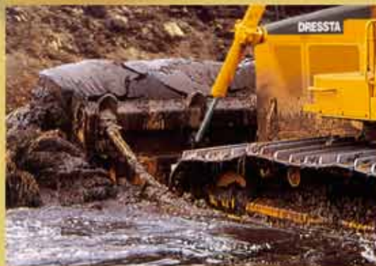
Straight blade of 3.6 cu.m (4.7 cu.yd) used with 2.16 m (85 in) gauge and 940 mm (37 in) track shoes (LGP) is designed for soft, swampy areas. This blade may be equipped with hydraulic tilt cylinder to perform efficiently landscaping operations.