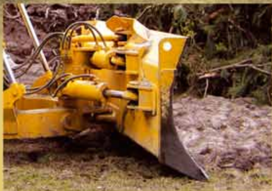
6-way hydraulic angle blade of 3.8 cu.m (5 cu.yd) used with 2.03 m (80 in) gauge wide track (WT) and max. shoe width of 560 mm (22 in) is applicable for versatile operations such as finish grading, spreading material and light land clearing.

Cummins QSC8.3 engine meets U.S. EPA Tier 3 and EU Stage IIIA emissions standards. The QSC advanced electronics provide enhanced engine performance with higher torque and better throttle response at every rpm. With its ideal combination of electronic controls and durable block design, this engine is ready to meet even toughest machine work conditions. Long maintenance intervals, better cold starting and quieter operation provide improved operator comfort.