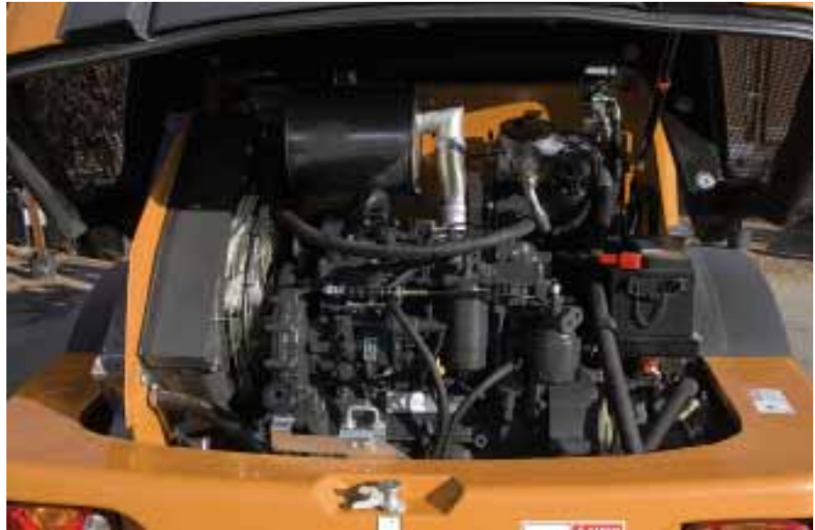
The flip-up hood makes access to the engine compartment simple.

Case compact wheel loaders are designed to provide years of trouble-free operation. Your Case dealer will keep your machines in peak condition with expert technicians, OEM parts and fluids, and a commitment to all your equipment needs.