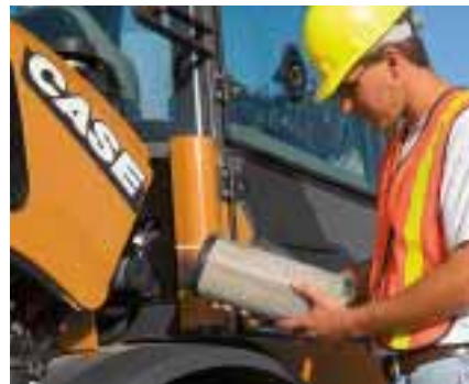
Daily service checks are completed from ground level, ensuring a quick start to a productive day.