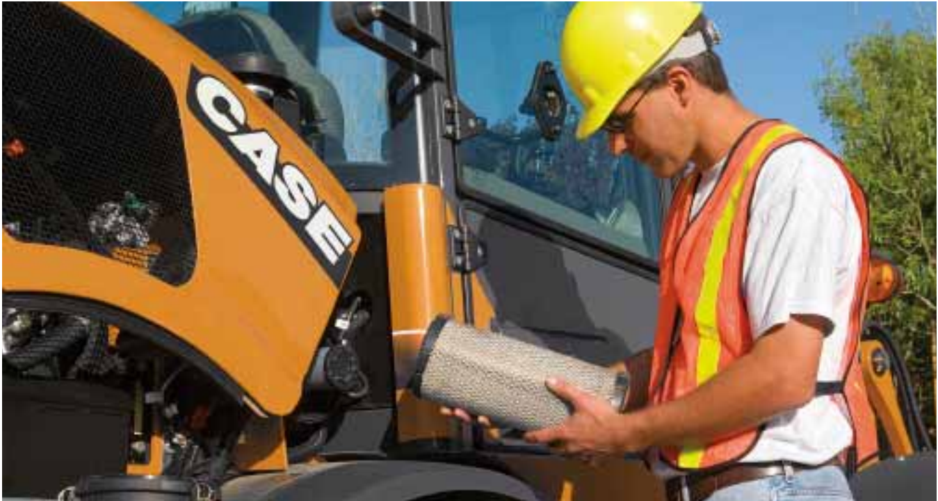
Manage your equipment better with a Case Care SM prepaid maintenance plan.