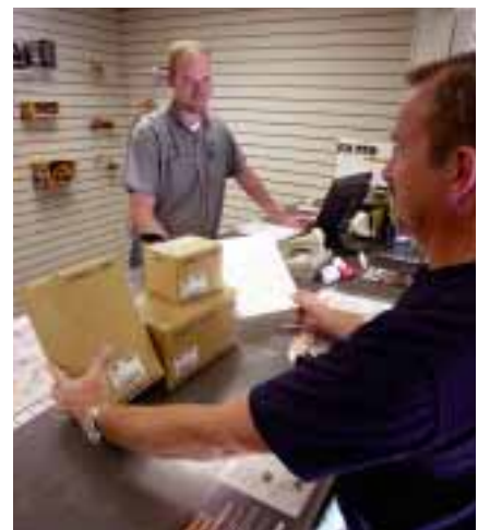
Your Case dealer is your professional partner with the know-how to keep your equipment up and running in peak condition.