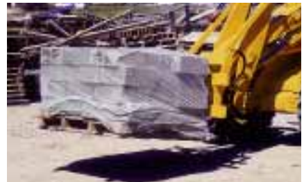
Scrap Grapple Bucket