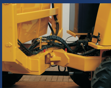
Articulation angle: 30 degrees