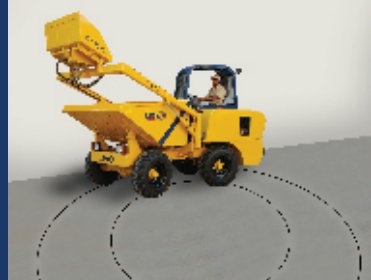
Short turning radius: 4.2 meters