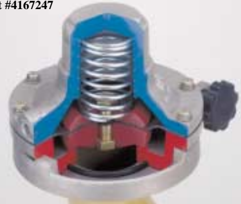
Patented Magnum™ Spray Head